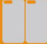
PUT IN PLACE