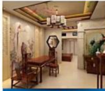
Building materials industry