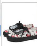
SHOES AND HATS