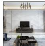
tile background wall