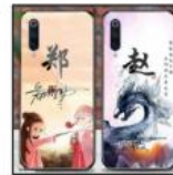
3C products shell