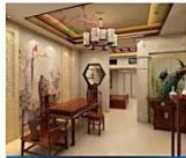
Building materials Industry