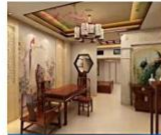
Building materials Industry